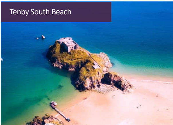
Tenby South Beach